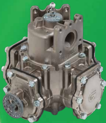
GB20-NP / GB21-NP / GBEL-NP Gilbarco® Advantage / MPD / Highline