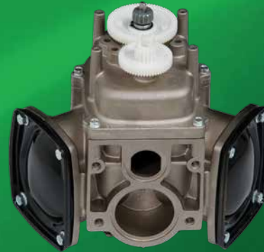
WYEL-NP Wayne® 2PM6