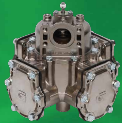
GBC+-NP Gilbarco® Encore