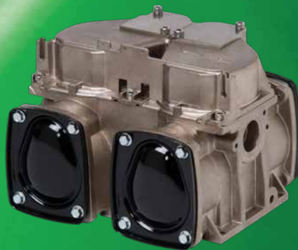
WYIM-NP Wayne® iMeter